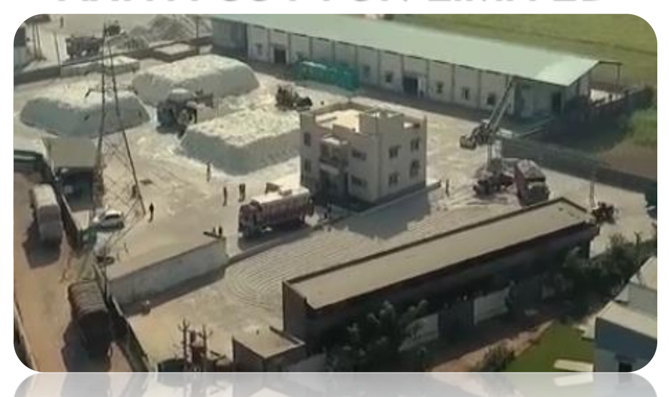
6th Annual Report - 2018-19